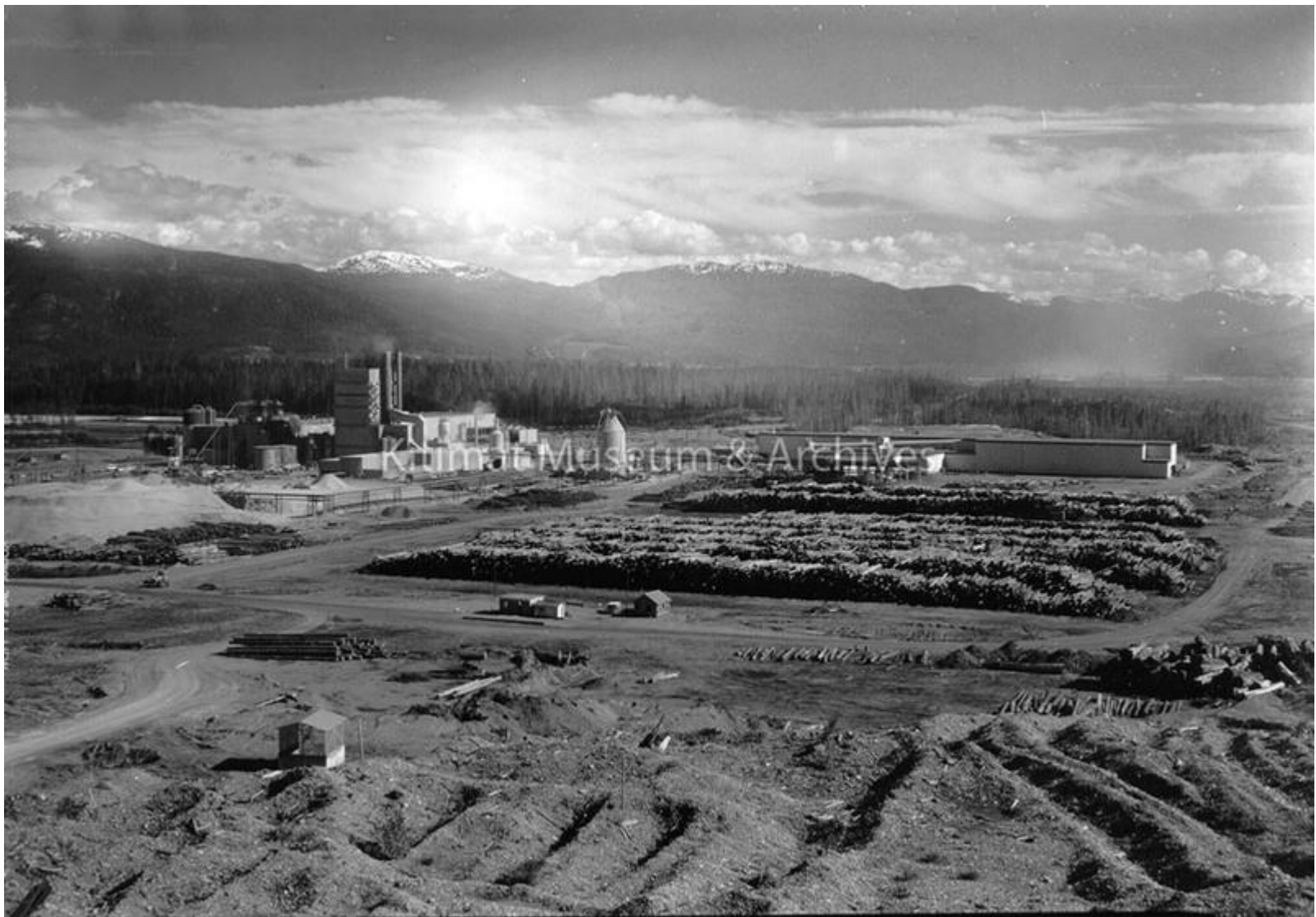
Eurocan Pulp & Paper Mill,” Kitimat Museum & Archives Collections, accessed May 4, 2022, http://search.kitimatmuseum.ca/items/show/4221